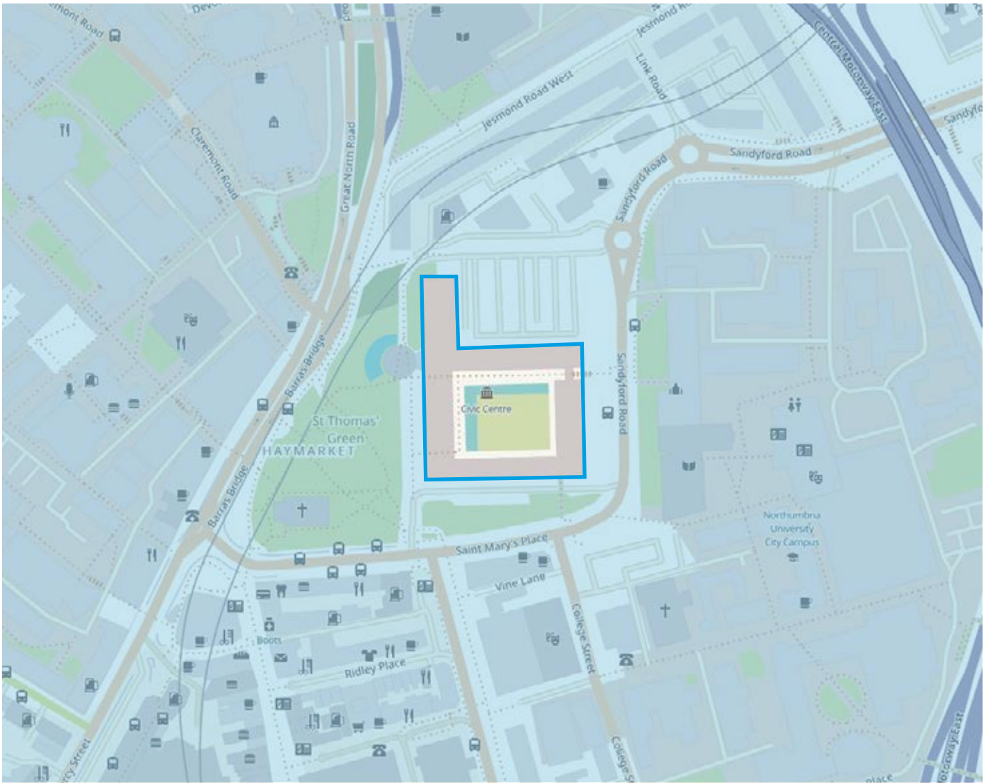
Newcastle Civic Centre Barras Bridge, Newcastle upon Tyne, NE1 8QH